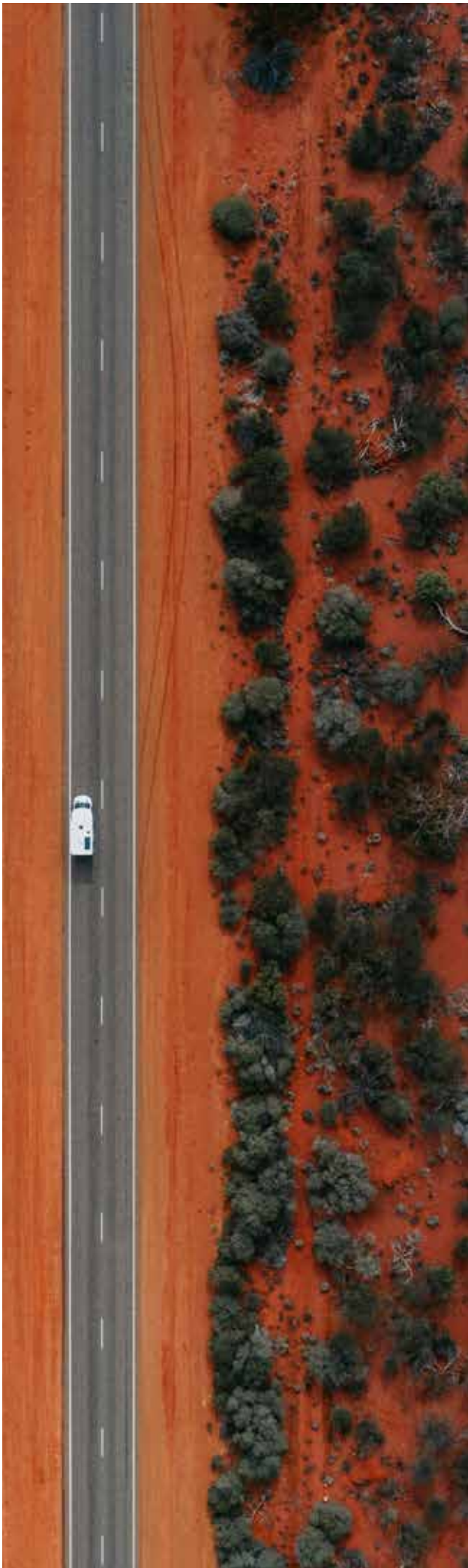
Shark Bay World Heritage Area.